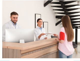
Hospitals & Clinics